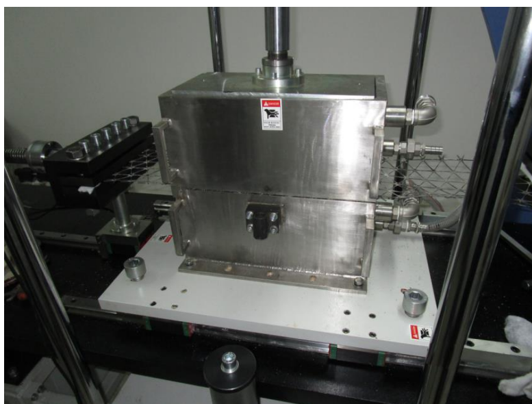
Shear box of DW1290DHP-2