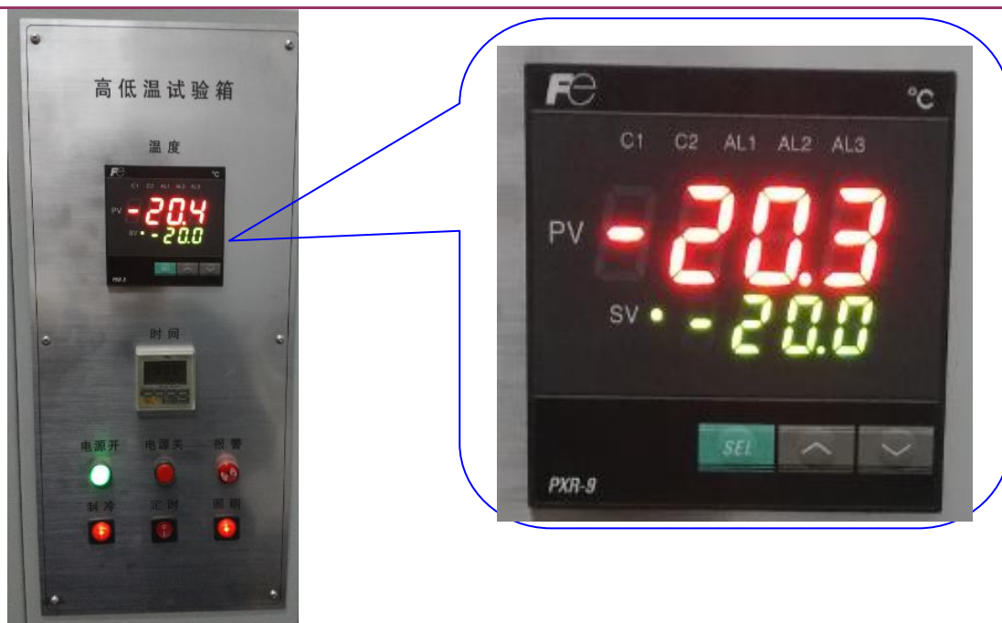
The chamber temperature display of DW1290MVT-3

FANYUAN INSTRUMENT (HF) CO., LTD. DOWELL SCIENCE & TECHNOLOGY (HK) CO., LTD. ADD: ROOM 1405#, TIANYI INTERNATIONAL BUILDING, NO.19 TIANBO ROAD, HI-TECH DISTRICT, HEFEI, CHINA POSTAL CODE: 230088 TEL: +86-551-68105003 FAX: +86-551-65232507 EMAIL: SALES@HKDOWELL.COM