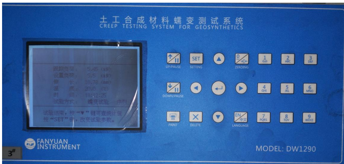
The display of DW1290MVT-3